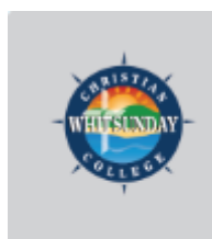
Whitsunday Christian College (Learner.Link)

To login as an observer, you must select the College your child attends by clicking its icon.